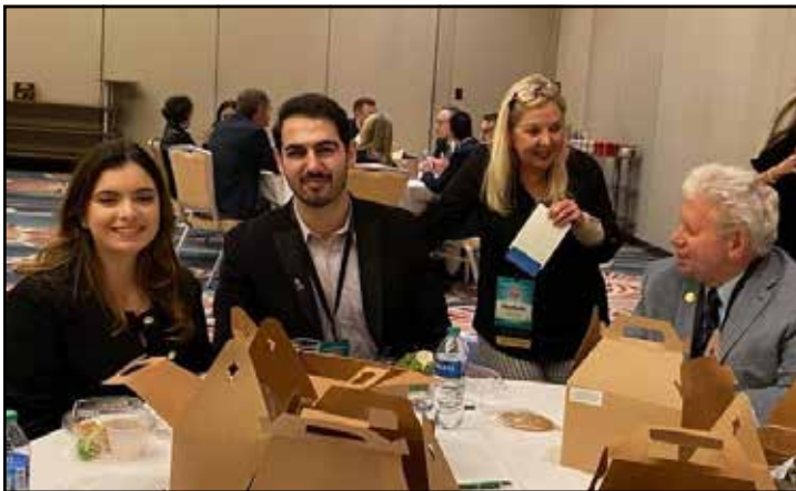
Residents relaxed and enjoyed lunch before the presentations.

In appreciation to the American Academy of Periodontology for underwriting the Resident/Faculty Luncheon.